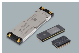
MIL-COTS BCM bus converter modules