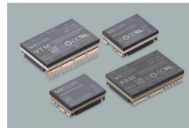
MIL-COTS PRM and VTM modules