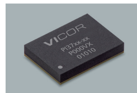
ZVS buck-boost regulators