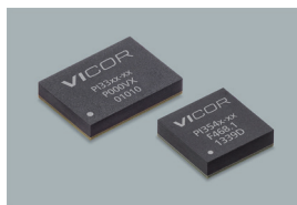
ZVS buck regulators