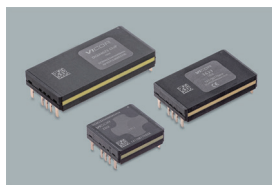
DCM DC-DC converters