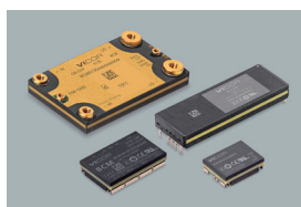
BCM bus converter modules