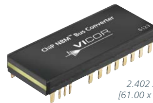
6123 ChiP 2.402 x 0.990 x 0.284in [61.00 x 25.14 x 7.21mm]